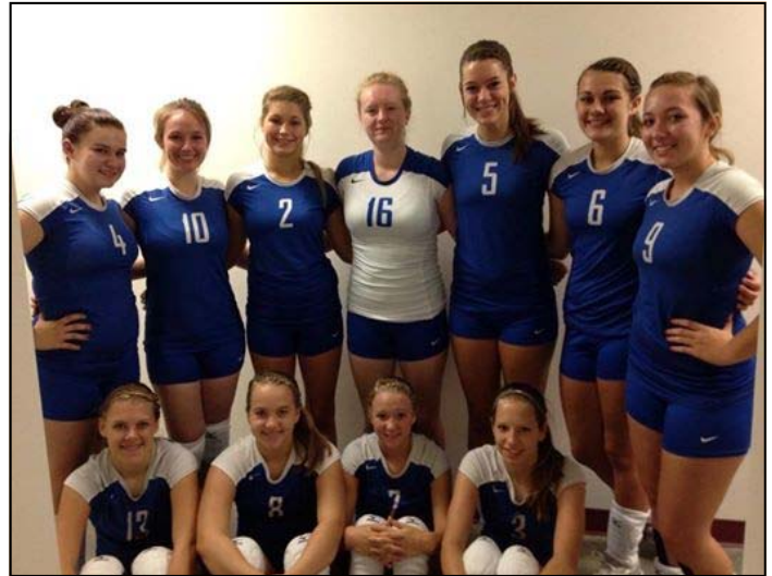
Members of the Lady Blue Dragons varsity volleyball squad who attended the pre-season tournament.

High hopes are given to the girls this year, but knowing their capabilities