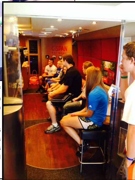
Right: Students attentively listen as the C-SPAN reps explain the bus and its purposes.